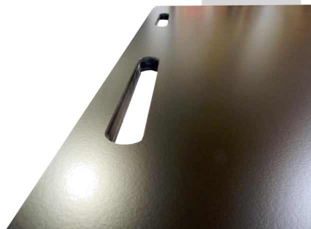
Slit for pipe and tubing