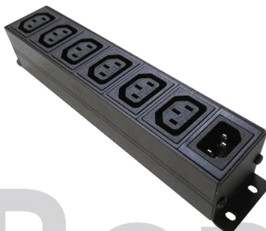
IEC power strip (optional ref IECKIT)