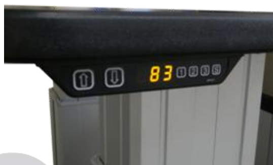
Optional position display with 3 memories (ref : BCHPOS)